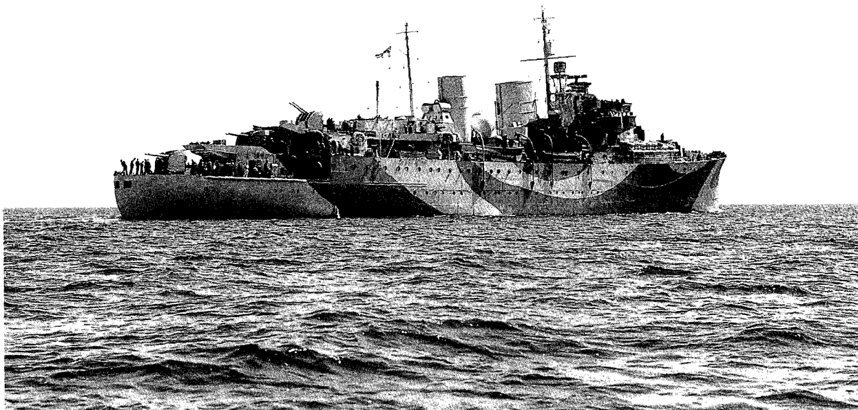
Aft view of HMCS Prince Robert in 1943. The three twin 4-inch gun mountings of the aft group are clearly visible.

mountings were made in Trenton, Ontario; the guns were the first 10 off the line from Sorel Industries, Sorel, Quebec; and the fuse-setting machinery was made by Reliance Gear Works in Vancouver, B.C. Secondary armament consisted of two 4-barrel, 2-pounder Mk.VII pom-poms, and six 20 mm hand-operated Oerlikon guns. The installation of a Rangefinder Director Mk.V, a Fuse Keeping Clock Mk.III*, a Fire Control Box Mk.II, a Gyro Roll Corrector Mk.VII, and an Automatic Barrage Unit Mk.I provided Prince Robert with a relatively sophisticated fire control system. Radar information came from a 272 Mk.III Surface Warning set, a 285 gun-ranging set, and a SW2-C radar set. The SW2-C was a modified version of the Canadian SW1-C that incorporated an Identification Friend or Foe (IFF) function capable of discerning friendly vessels or aircraft from unfriendly ones. 58 The ship's complement mushroomed to 33 officers and 405 ratings. 59 With the exception of building Tribal-class destroyers, the refit of the Prince Robert was